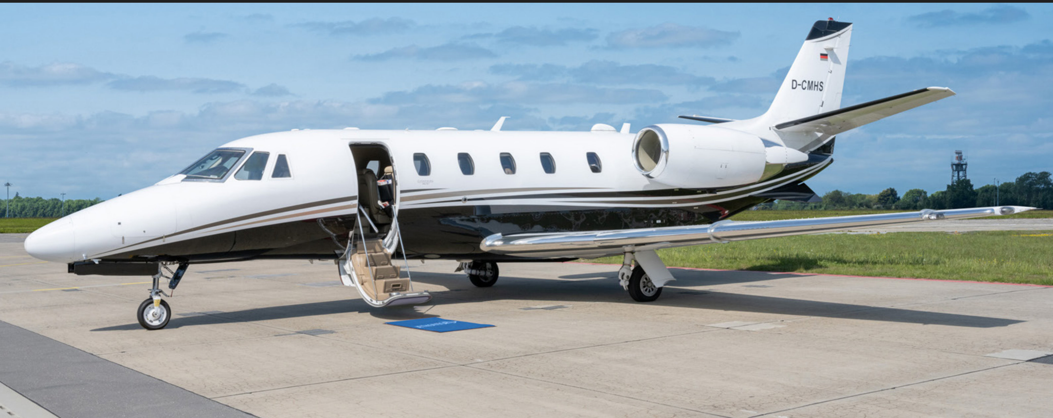
2013 Cessna Citation XLS+ SN 560XL-6140